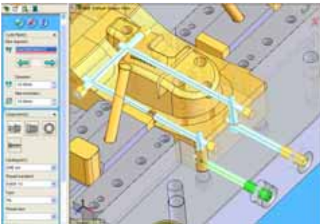
Heat Exchange Preview

Automatic size estimation and creation of an initial mold assembly from a choice of over 15 standard commercial libraries, in minutes. Easy to use dialogues and dynamic preview allow you to visualize the exact standard or non-standard mold base to suit your insert design, and create it with a click of a button. You are able to estimate the cost of the mold on the spot, and speed up the initial mold design by up to 90%.